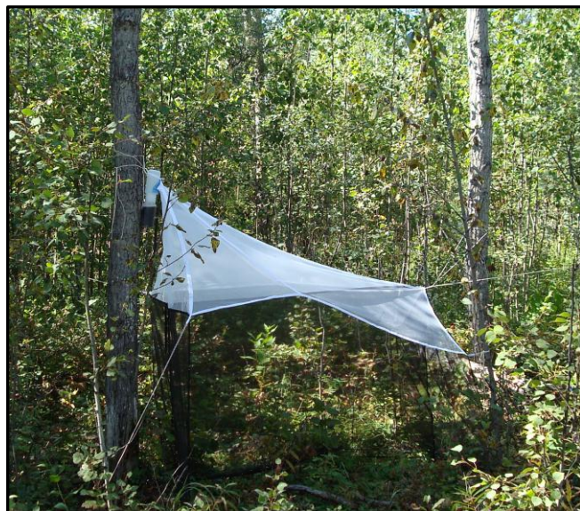
Figure 3: A Malaise trap in a partially harvested stand at EMEND.

We conducted this study in deciduous-dominated stands at EMEND in 2008, eight years post-harvest. We collected ichneumonids using Malaise traps (Figure 3) within three different harvesting treatments (clear-cut, 20% retention, 50% retention) and uncut controls, with two replicates of each treatment and control.