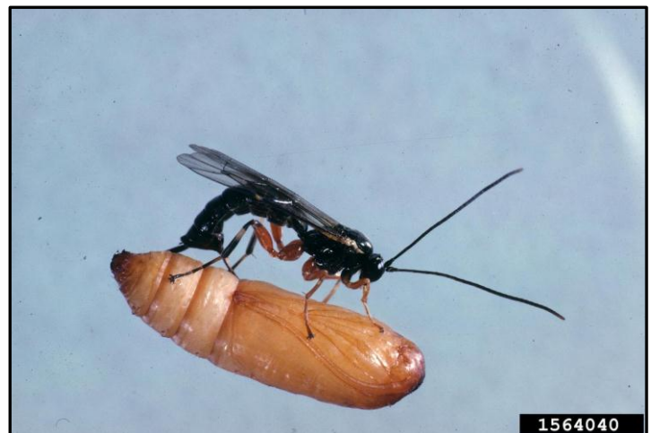
Figure 2: An example of a parasitoid laying its eggs into a host.

Parasitoids have sometimes been used by humans as biocontrol agents to target pest species, especially non-native species, and bring them under control. In fact, the classic biocontrol examples involve the introduction of a plant-eating insect (herbivore) into an area where its parasitoids are not present. The species is then able to proliferate uncontrollably, becoming a serious pest in its new range, even when it was rare and non-destructive in its native range. Introducing its parasitoid(s) from its native range is often effective at stemming this uncontrolled population growth and reducing the herbivore's destructiveness. This exact scenario is happening constantly in natural ecosystems – parasitoids are quietly keeping herbivore populations in check, often unnoticed and unappreciated.