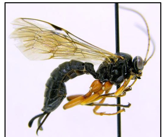
Figure 1: Apechthis picticornis . An example of Ichneumonidae from the subfamily Pimplinae.