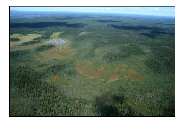
Wet sites burn less easily and are highly important for conserving beetle diversity.

The Ecosystem-based Management Emulating Natural Disturbance (EMEND) Project is a multi-partner, collaborative forest research program. The EMEND project documents the response of ecological processes to experimentally-delivered variable retention and fire treatments. The research site is located in the western boreal forest near Peace River, Alberta, Canada, with monitoring and research scheduled for an entire forest rotation (i.e. 80 years).