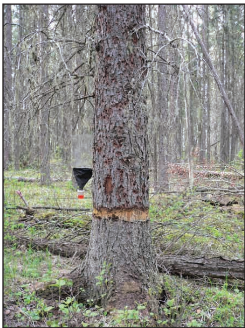
Figure 2. Flight intercept trap attached to a girdled tree.

Saproxylic insects inhabiting standing deadwood (snags) were sampled at EMEND using flight intercept traps (Figure 2). The traps were placed in control stands of all four cover types, all harvesting treatments of the conifer-dominated sites, and a standing timber burn from 1999. Traps were attached to girdled and standing dead trees that naturally release chemicals which attract saproxylic insects. These traps yielded over 31 000 saproxylic beetles and 262 species, representing a considerable proportion of the beetle biodiversity found at the EMEND site.