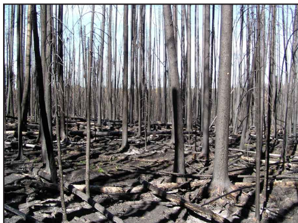
Figure 4. Fire is an important landscape element for some species.

Historically, fire has been an important factor shaping age class distributions in the boreal forest. It creates unique habitats for fire-adapted organisms. Many beetle species seek recently-burned areas to take advantage of the newly-created deadwood. One species, Melanophila acuminata (DeGeer) has been shown to possess a special sensory device that allows it to detect and orient its flight pattern to smoke and heat from a burning forest. Burned patches of the prescribed fire at EMEND supported a higher diversity of beetles than unburned patches. Thirteen species were significant indicators of burned areas. Two ground beetle (Carabidae) species were found only in these areas ( Sericoda quadripunctata (DeGeer), Sericoda bembidioides Kirby). These pyrophilic (fire-loving) species are assumed to have habitat requirements that are not emulated in any of the harvesting treatments, although the specific nature of these requirements is not yet fully understood. Clearly, it is important to maintain some level of fire on the landscape to support this unique group of insects.