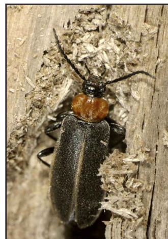
Figure 1. Deadwood associated beetle ( Schizotus cervicalis ) emerging from aspen log.

Deadwood-associated (or saproxylic) species play important roles in nutrient cycles and the healthy functioning of forests. They also comprise a large proportion of the biodiversity in forests. For example, in Finland, 20-25% of the 19 000 known animal, plant and fungus species in the boreal forest are thought to be associated with deadwood. These deadwood-associated species received little attention until Siitonen and Martikainen (1994) provided strong evidence implicating industrial forest harvesting in the endangerment and extinction of many saproxylic beetles in Finland.